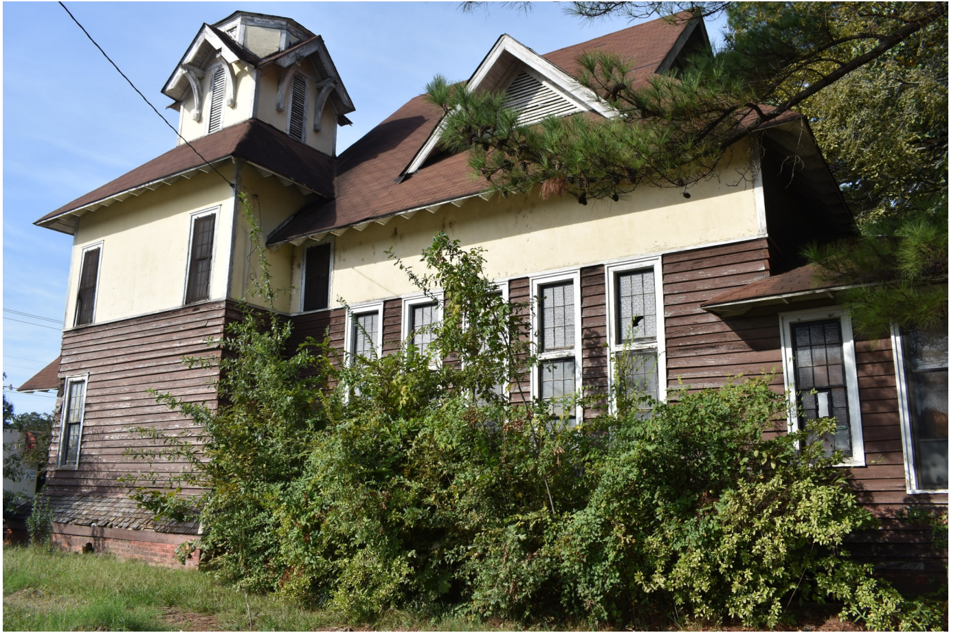
First Christian Church, Lonoke, Ark.