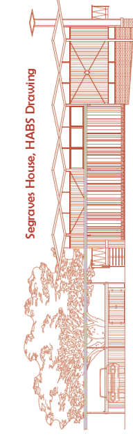
Segraves House, HABS Drawing